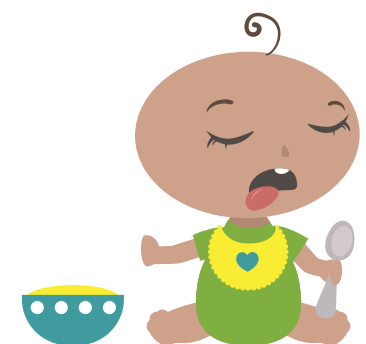
Loss of appetite